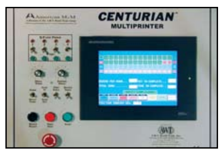
State-of-the-art PLC features online production and troubleshooting data.