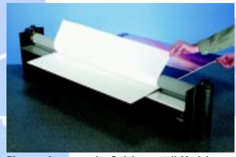
Picture show you the Quickmount II Model, the work principle is the same...

For mounting, it rolls down media to boards and other substrates, smoothly and easily