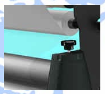
Two knobs set the height and pressure of the top roller.

You do not need to be an expert to laminate. QUICKMOUNT makes it fast and easy.