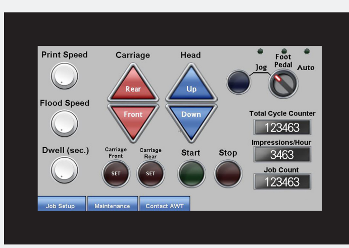
The touchscreen allows the operator to control a variety of functions such as print and flood speeds, carriage and print head position and cycle counts, with a simple touch.