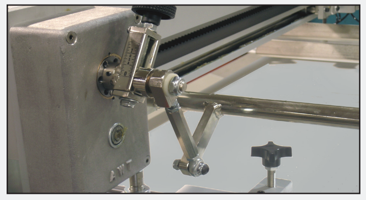
Exclusive upfront peel system gives operator quick and convenient control of peel rate setting.

Whether you are in the popular signage industry or specialize in manufacturing and marketing support, the Accu-Print High-Tech Micro™ is a proven performer for small–format graphics producers. Yielding outstanding results with hundreds of substrates, the High-Tech Micro delivers up to 900 pieces per hour while maintaining consistent image quality.