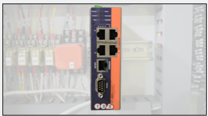
Remote Diagnostics System PLC provides a direct link to A.W.T., making quick identification and correction of malfunction sources. With this feature, many onsite service calls can be eliminated.